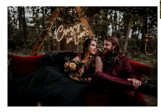
Hudson Street Photography Kailyn Andrews Photography Photographer Olivia Rubin